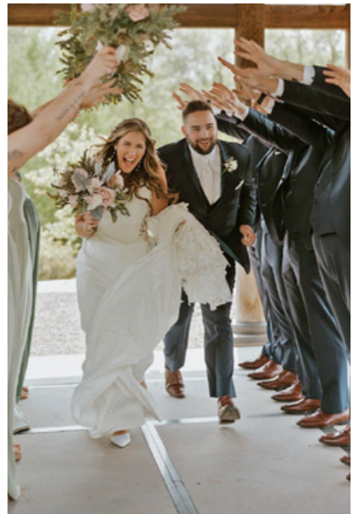
Wood Pavilion, Stone Tatami