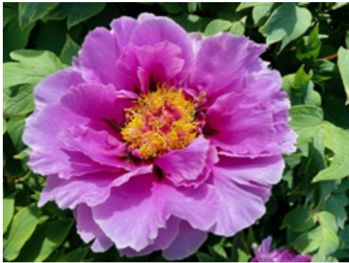
Chinese Peony (Paeonia lactiflora)

This Garden also features famous botanical specimens like hydrangeas, roses, and peonies throughout spring and summer. These make great natural floral backdrops in photographs. Ask us when they are in bloom!