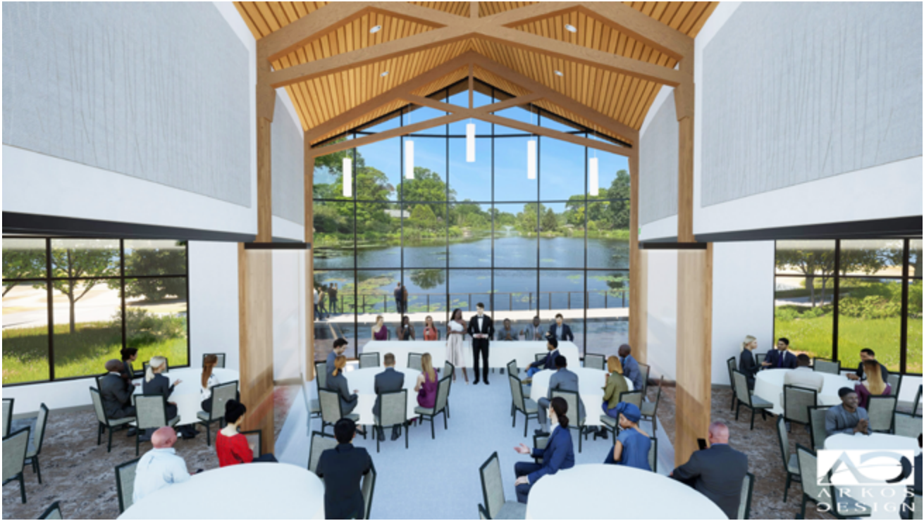
Events and Visitors Center, "Window on Wellfield", North & South meeting rooms plus Grand Hall

Indoor & Outdoor Pavilion Spaces, available to book now for events beginning May 2025.