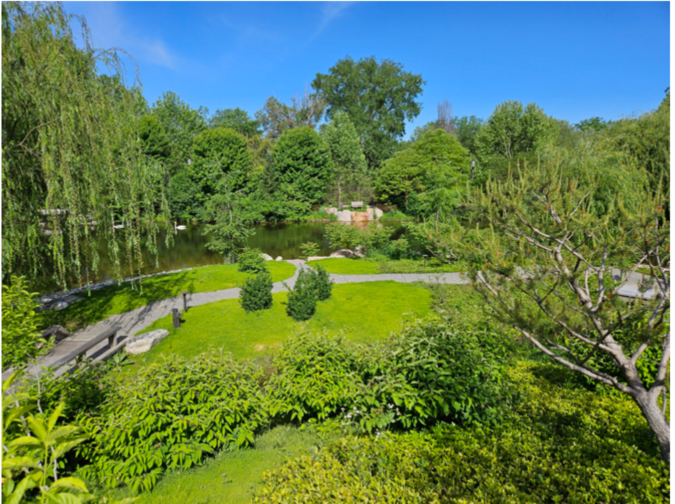
Grassy lower area

All Island Garden rentals include both the grassy lower area and the Wood pavilion. Chairs can face east, west, with or without an aisle.